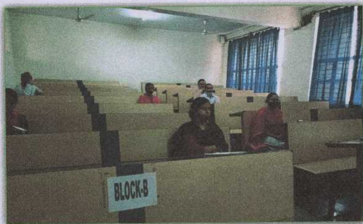
Interaction During Audit